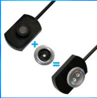
MITS-3 Button Mic™